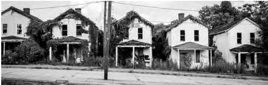
Figure 4. Row houses in Monessen, PA. Cropped image of photograph by Pete Marovich (Newton 2017)