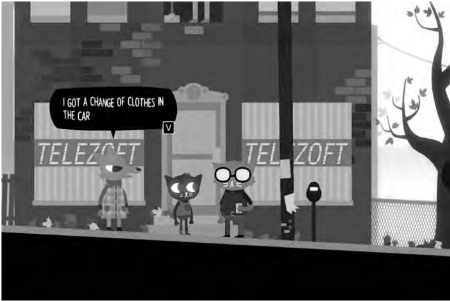
Figure 2. The Telezoft call center in Possum Springs (author screenshot)

games exert agency and emphasizes our two underdiscussed issues—class and mental health—in compelling and complex ways given the actions of Mae, her fellow residents, and the town of Possum Springs itself. These elements and this setting purposefully seek to balance these two themes. Indeed, they feed off each other.