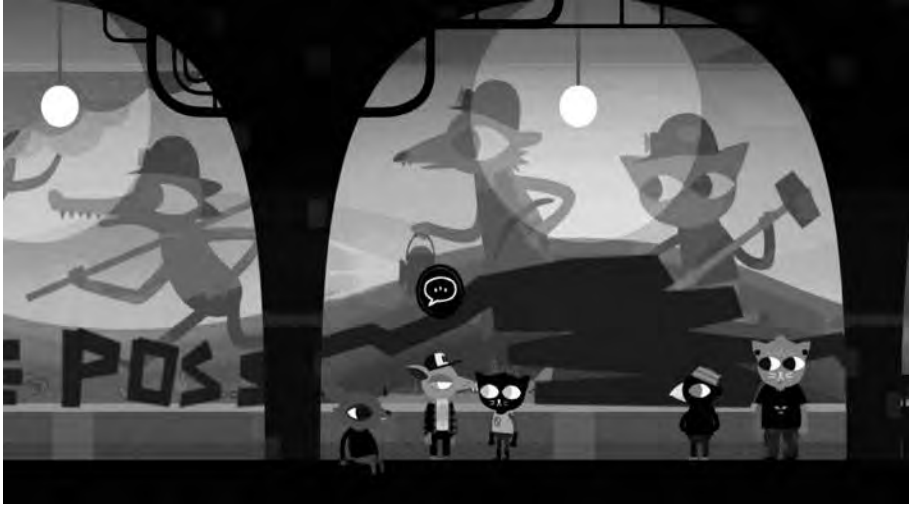
Figure 1. Mae talking with some teens that hang out in the Trolley Tunnel beneath the town; the mural behind them has just recently been defaced (author screenshot)

instead relegated to service-level jobs, if they are employed at all.