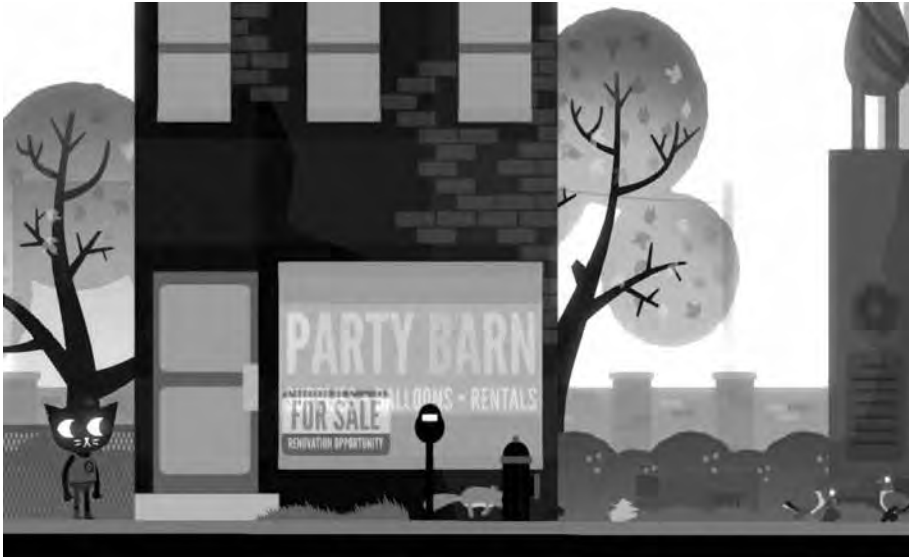
Figure 3. Mae and the closed Party Barn

(31) as demonstrations of how games can make class visible yet fail to provide a useful way to think about class in broader terms.