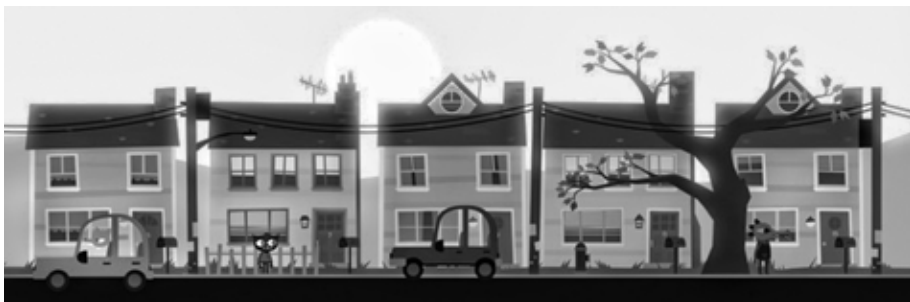
Figure 5. Row houses in Possum Springs from Night in the Woods , with visual elements similar to photograph by Pete Marovich. (author screenshot).

wither and die on porches and street corners, working-class folks are trapped in small stores, diners, or relevant break areas, and young people leave (if they can) and do not return. The plotline parodies the generational anger at the death of the town, making older residents killers in the woods, which functions as a metaphor that seeks to capture much of the anger and blame currently infecting modern American discourse. It is no accident that both of the major areas of the plotline are separated geographically. The elders have taken themselves out of the town, and thus out of its community, and they are shrouded in secrecy doing “what must be done” in the woods. This separation of action and area can be seen clearly on the map of Possum Springs presented by the Historical Society, as shown in figure 6, which further underscores the idea of generational divide and downward mobility. The old abandon hope; the young flee the map and do not return (if they can avoid it), the working-class citizens are trapped in the